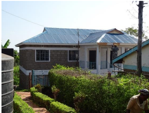
Second storey of staff houses

The Izaak Walton Inn, our Embu accommodation, had upgraded us to better rooms, apparently because we were regular visitors. That was a good start! The next thing to thrill me was finding that our paint shop had invested in a paint-mixer! I cannot describe the thrill of being able to choose a colour that was neither magnolia nor royal blue. Although Kenyans actually like magnolia, we decided to have some fun and we painted two classroom walls bright red and two bright yellow. The kids loved it and eventually one of the nursery teachers asked for his desk to be painted red! This led to all the children’s chairs having to be painted too!