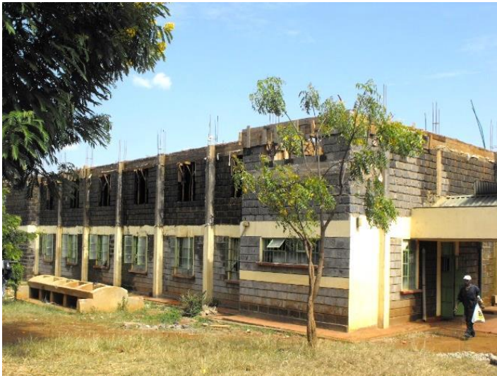
Utugi—second storey to dorm

The team also included six people who worked at Utugi Boys Home, having fundraised separately for this. Luckily, they had managed to procure a huge overseas grant from a company in Dubai, so they were able to pay for the second storey of the boys' dormitory that I was involved in building in 2004. Each group visited the other to see the work we were all involved with this trip.